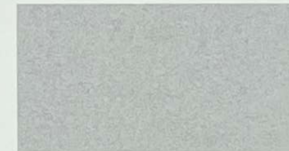
744 Brilliant Silver